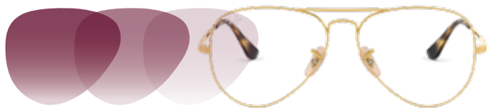
Lenses darken when exposed to higher UV levels.

With Transitions® GEN S™, navigate life effortlessly. Transitions® GEN S™ adapts amazingly fast to all light conditions providing optimal responsiveness every time, everywhere.